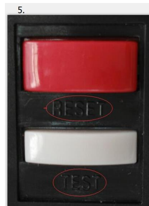
RESET & TEST BUTTON